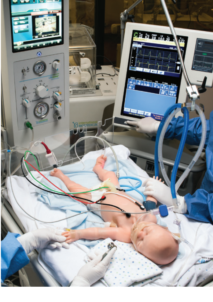
SUPER TORY features bilateral, midaxillary surgical sites for needle decompression and chest tube insertion exercises.