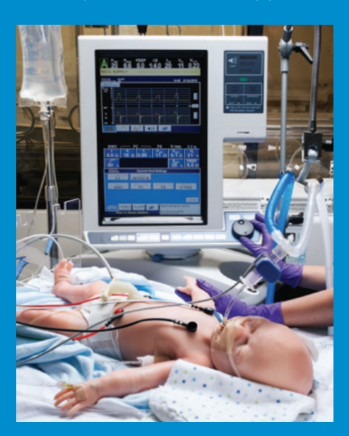
Internal and external critical care transport